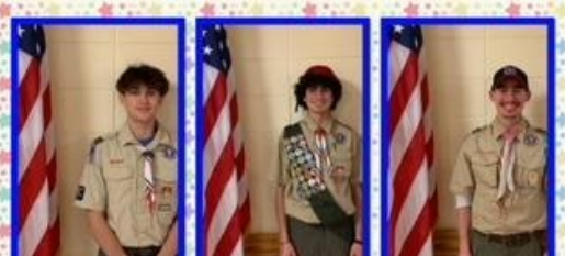
128 Eagle Scouts...and counting