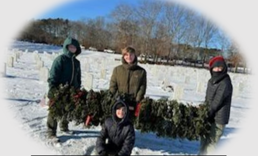
Calverton Wreath Laying - Honoring our Veterans