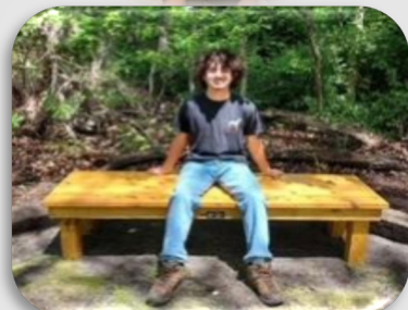
Eagle Scout Projects