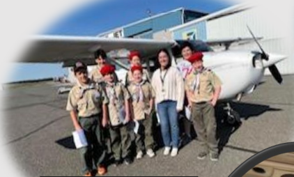
Earning Merit Badges