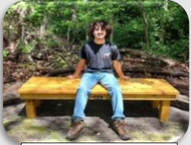
Eagle Scout Projects