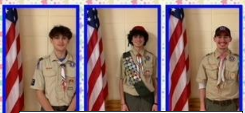
128 Eagle Scouts...and counting