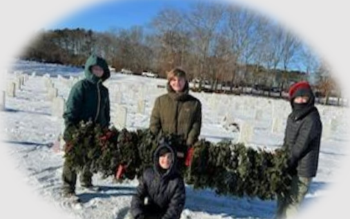
Calverton Wreath Laying - Honoring our Veterans